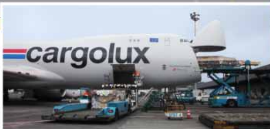
Our cargo loads through the nose of this Boeing 747 freighter aircraft